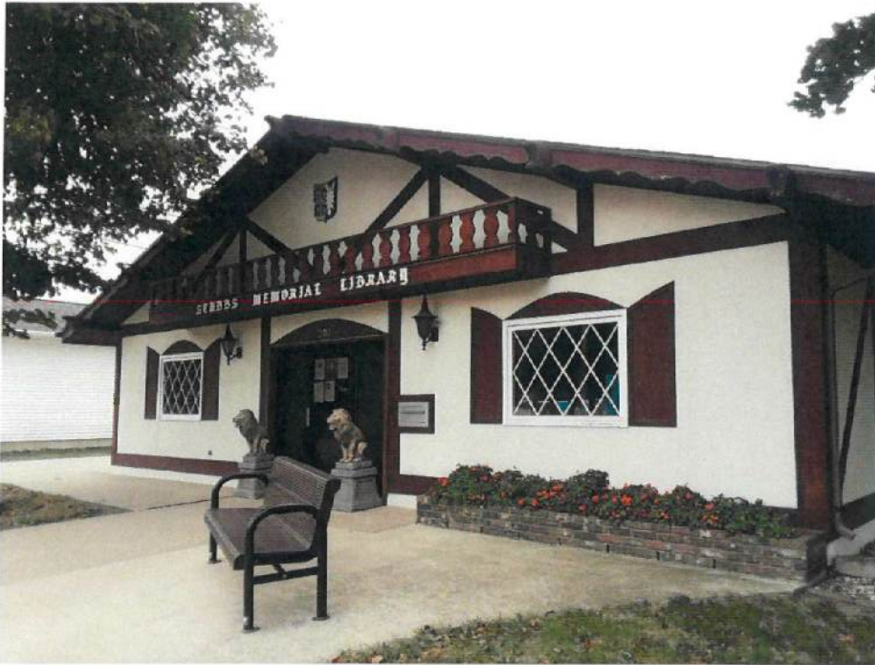
CELEBRATING 74 YEARS OF SERVICE